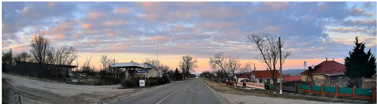
Figure 4. The M3 Cimislia – Comrat road, the proposed sector for the installation of sound-absorbing panels between km 5+555 – 9+790. Photograph point - GPS coordinates (EPSG:4326): Lat. 46.441967 N, Long. 28.746467 E, southbound