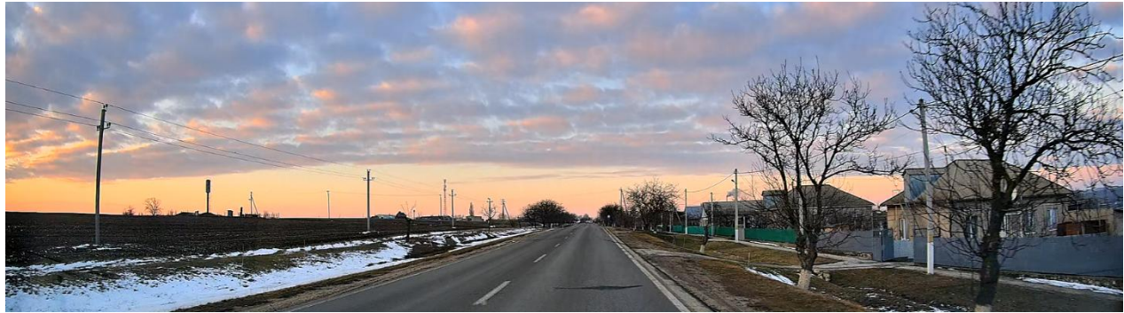
Figure 3. The M3 Cimislia – Comrat road, the proposed sector for the installation of sound-absorbing panels between km 5+555 – 9+790. Photo point - GPS coordinates (EPSG:4326): Lat. 46.437350 N, Long. 28.747700 E, northbound