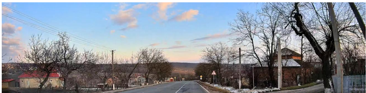
Figure 5. The M3 Cimislia – Comrat road, the proposed sector for the installation of sound-absorbing panels between km 6+490 – 6+990. Photograph point - GPS coordinates (EPSG:4326): Lat. 46.429867 N, Long. 28.753050 E, southeast direction