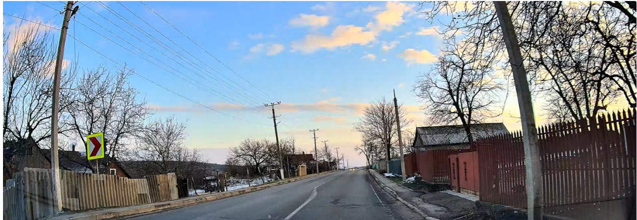
Figure 6. The M3 Cimislia – Comrat road, the proposed sector for the installation of sound-absorbing panels between km 5+555 – 9+790 (left) – km 8+065 – 11+987 (right). Photograph point - GPS coordinates (EPSG:4326): Lat. 46.428883 N, Long. 28.754983 E, southbound