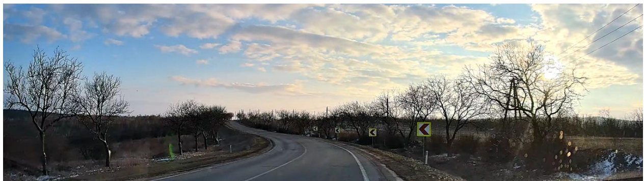
Figure 2. The M3 Cimislia – Comrat road, the proposed sector for the installation of sound-absorbing panels between km 0+380 – 0+860. Photograph point - GPS coordinates (EPSG:4326): Lat. 46.498333 N, Long. 28.757417 E, southwest direction